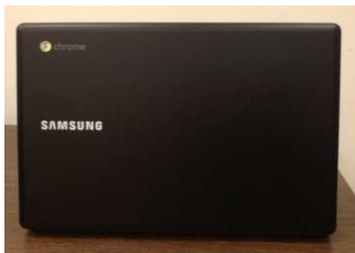
47. Chromebook (WiFi, 11.6")