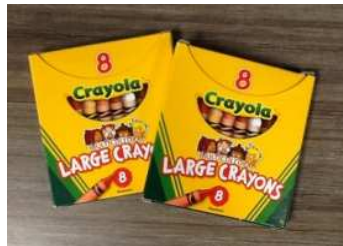
4. Multicultural Large Crayons