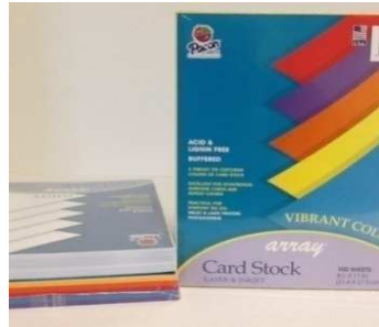
33. Card Stock