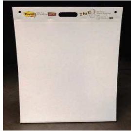
44. Dry Erase Table Top Pad