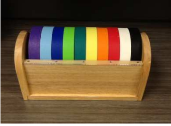
39. 1" Colored Masking Tape & Dispenser

The following items must stay inside the library ( May only request 1 total)