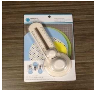
7. Large Circle Cutter