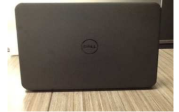
46. 15.6" Laptop