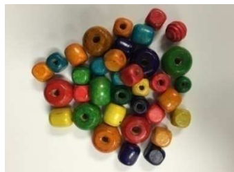
22. Wooden beads