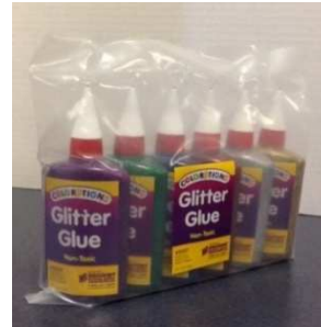
11. Glitter Glue