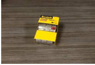
13. Double-Sided Tape