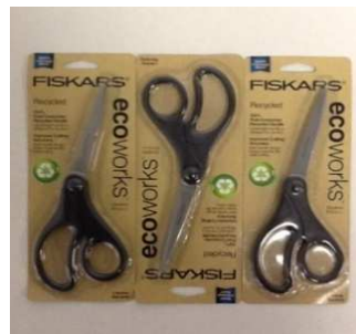
8. 8" Teacher Scissors