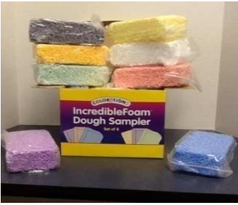
26. Foam dough