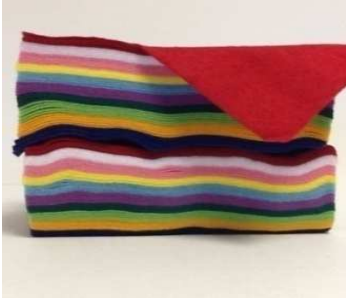
14. Felt Sheets