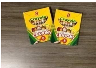
3. Multicultural Standard Crayons