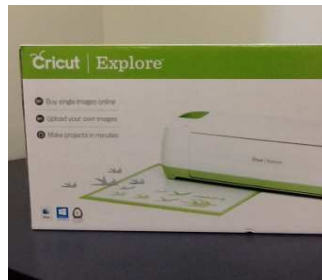
48. Cricut Explore (Paper cutting machine) Available at Central Library only