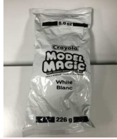
27. Modeling Clay - Crayola® Model Magic 8 oz (White) Limit 1 per student