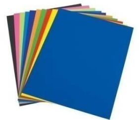
38. Colored Poster Board