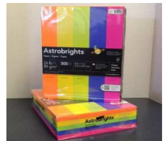
34. Bright Color Paper, 8 1/2" x 11"