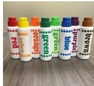
5. Dot Art Markers Available at Central Library Only