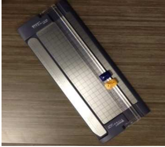
43. Paper Trimmer