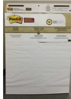
45. Easel Pad