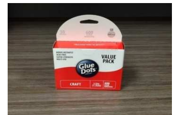
12. Glue Dots