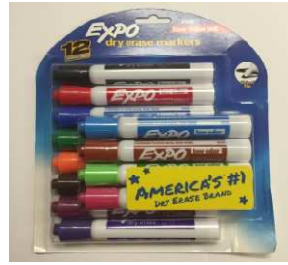
41. Dry Erase Markers