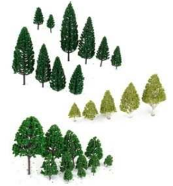
17. Mini trees