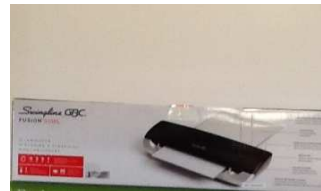
49. Laminator - Fusion 3100L 12" Available at Central Library Only