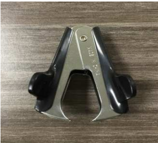
35. Staple Remover