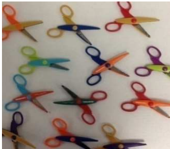
6. Krazy Kut Scissors