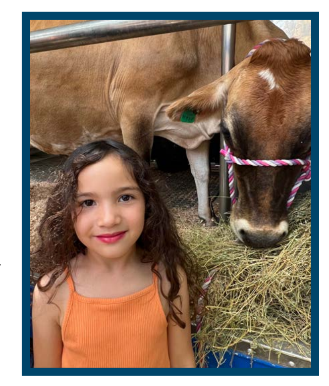
Upland Public Library farm field trip with Lunch at the Library attendees.