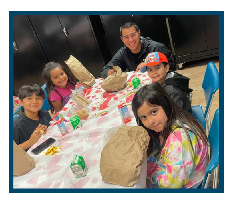
Children eating lunch at a library in Monterey County.

Restricting meals to only minors leaves caregivers who are often also experiencing food insecurity unfed, and some California children unable to access meals during the summer. Further flexibility in the Summer Food Service Program would lessen these