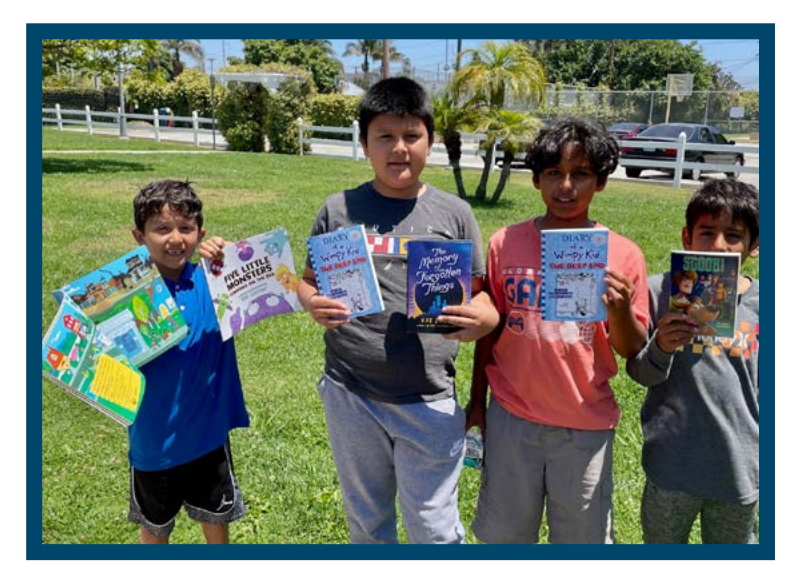
Children displaying new books received from the Inglewood Public Library to build their home libraries.

As trusted spaces at the heart of a community, libraries make ideal summer meal sites. This summer, 183 branch libraries served summer meals and library staff provided pop-up library and enrichment services at 412 community meal sites. More than 271,000 meals were provided to youth at library meal sites and community meal sites receiving pop-up library and enrichment services.