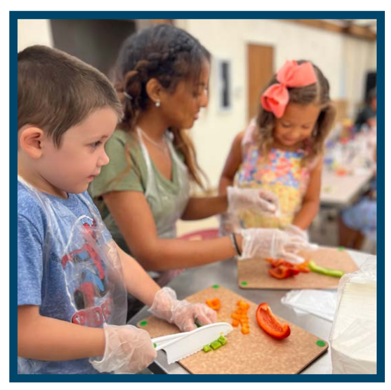
Sacramento Public Library children chopping vegetables during nutrition education activity.