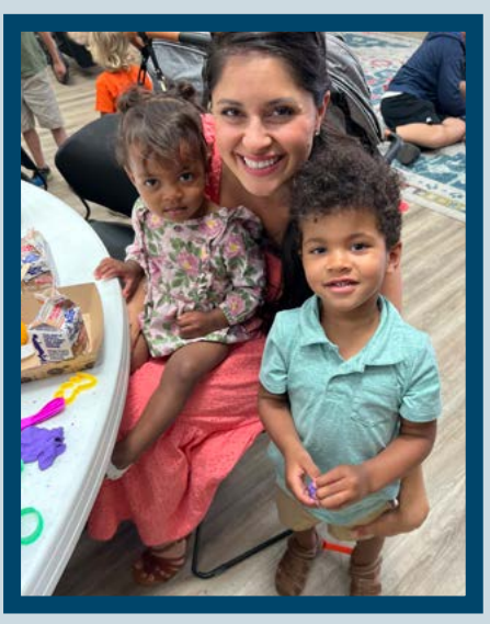
Family at Upland Public Library meal site