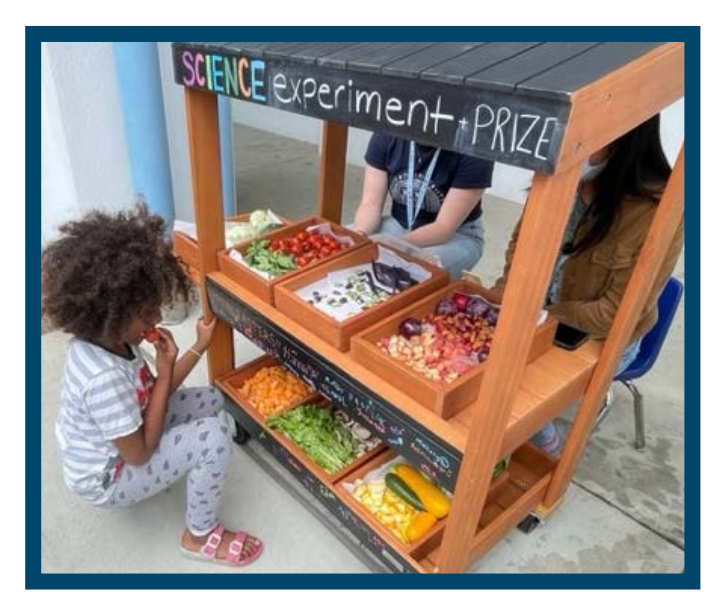
Oceanside Public Library's vegetable tasting stand.

The importance of connecting children to quality nutrition during the summer is well documented. Only one in six California children who qualify for free or reduced-price lunches also receive summer meals (Food Research Action Center 2023, 10). Over 2 million children in California who were eligible to receive free and reduced-priced lunch did not access summer lunches through any USDA program in summer 2022.