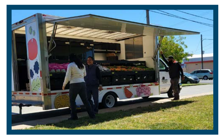
Produce vehicle from the food bank in Monterey County.

At the local level, participating libraries work with local governments and community agencies to provide support and wrap-around services for families. For example, Monterey County Free Libraries partnered with local businesses, agricultural companies, and food banks to provide 450 meals for caregivers and 23,779 pounds of produce to local families. In the coming year, the library plans to continue building a regional network and coalition in South Monterey County to connect more families with food.