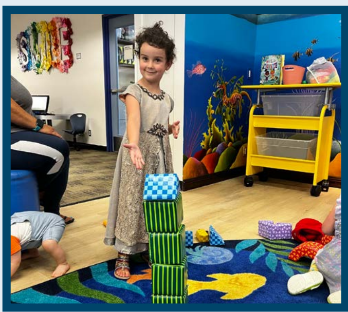
Oceanside Public Library's Early Learning and Community Information Hub