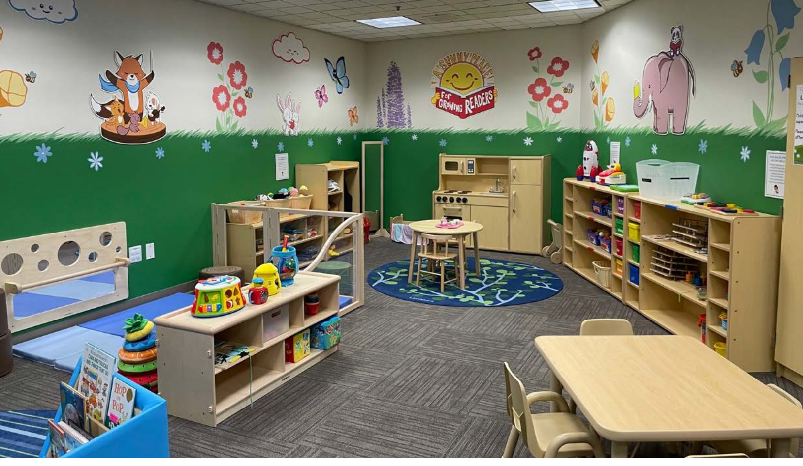
Sunnyvale Public Library's "A Sunny Place for Growing Readers" Early Learning Hub