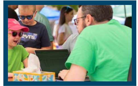
A young girl at Lodi Public Library signs up for the Summer Reading Program during lunch service.

Libraries hosted a total of 10,752 enrichment programs alongside the meal service at library meal sites and other community meal sites. Activities included early literacy and STEAM programs, nutrition education, and environmental education. Programs were designed to appeal to different age groups, demographics, and learning styles, and to keep children engaged in learning throughout the summer. Youth and families also received 167,364 books to help them build home libraries and connect them to summer reading programs.