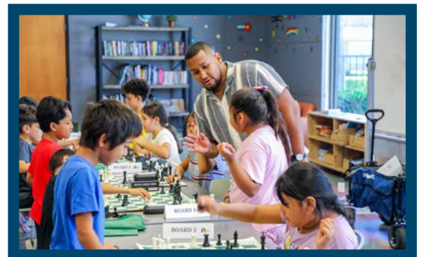
Children at the Anaheim Public Library learn to play chess during Lunch at the Library.

The high levels of agreement suggest that this program is effective in meeting the needs of the community by addressing food insecurity and offering social connection.