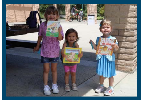
Children receive books to build their home libraries at the Simi Valley Public Library.

“Bodies were fed; brains were nourished; friendships were made; a love of reading was instilled in many for the first time.”