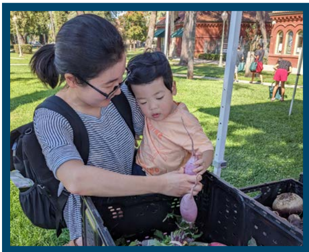
A young family picks out produce to take home at the A.K. Smily Public Library.

Further, California children whose parents cannot receive summer meals may be less likely to attend and access summer meal services as their parents are less inclined to take them.