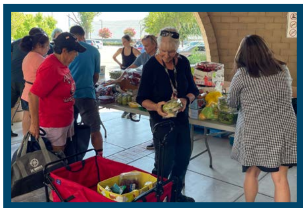
Families receive fresh produce during food distribution at the Stanislaus County Library.

Participating libraries also work with local governments and community agencies to provide support and wrap-around services for families.