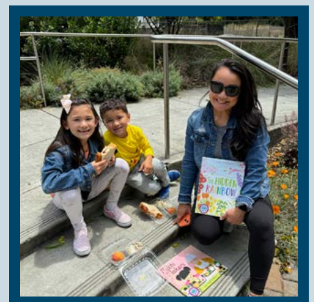
A family eats lunch at the Contra Costa County Library after receiving new books to build their home library.