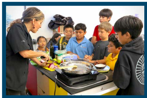
Children engage in a nutrition education cooking class with the San Mateo County Libraries.