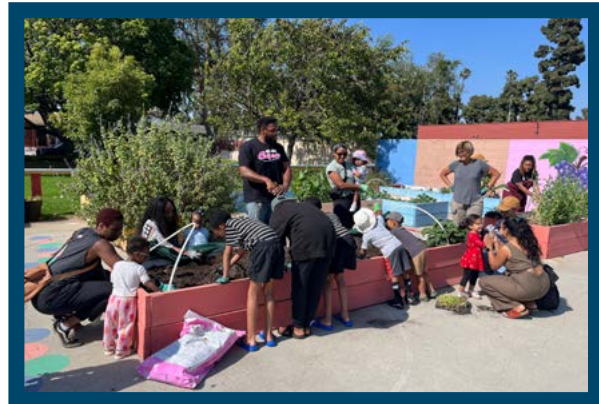
Families plant a community garden during Inglewood Public Library's Farm to Summer program.