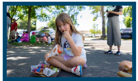
A young girl eats lunch at the Lodi Public Library.

Nevertheless, to the extent resources allow, in 2025 the State Library will work to increase the number of participating library jurisdictions and Lunch at the Library meal sites by providing interested library staff with opportunities to visit successful library meal sites, develop new partnerships, and provide technical assistance, professional development opportunities, and support to libraries and their partners.