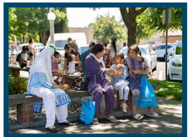
A family sits outside Lodi Public Library eating lunch together.

Youth participants also reported strong engagement, with 76 percent of children and teens saying they benefited from the wraparound learning and enrichment programs, which included educational presentations and reading support. Additionally, teens gained valuable social, emotional, and workforce readiness skills through volunteer and internship opportunities, with 98 percent saying that they felt they contributed to their community and 93 percent reporting enhanced job skills and personal growth.