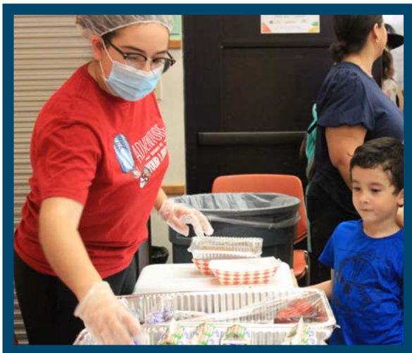
A volunteer serves meals at the Camerena Memorial Public Library Lunch at the Library program.

“The gratitude we’ve received reinforces how vital this program is for our community. Lunch at the Library is not just about food; it’s about fostering relationships, education, and well-being among families who need it most.”