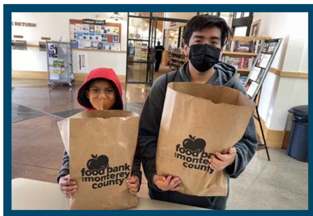
Youth at Monterey County Free Libraries receive food bank bags.