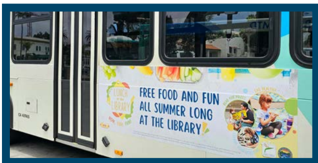
Santa Barbara Public Library bus advertisement promotes Lunch at the Library.

Sonoma County Library partnered with the Children’s Museum of Sonoma County to create a “Potter the Otter” healthy foods exhibit in their local mall that also served as an USDA meal site run by library staff. This library meal site was one of the library’s most heavily visited summer meal sites last year.