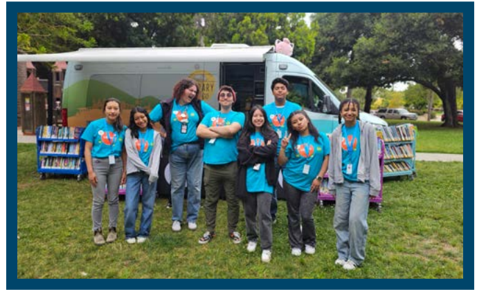
Santa Barbara Public Library teen intern cohort.

Youth Development opportunities at Lunch at the Library programs continued to grow this year. Lunch at the Library helps teens develop social, emotional, and workforce readiness skills by providing teens with volunteer opportunities and paid internships. Teens support Lunch at the Library by serving meals, planning and conducting programs, tracking statistics, and assisting library staff throughout the program.