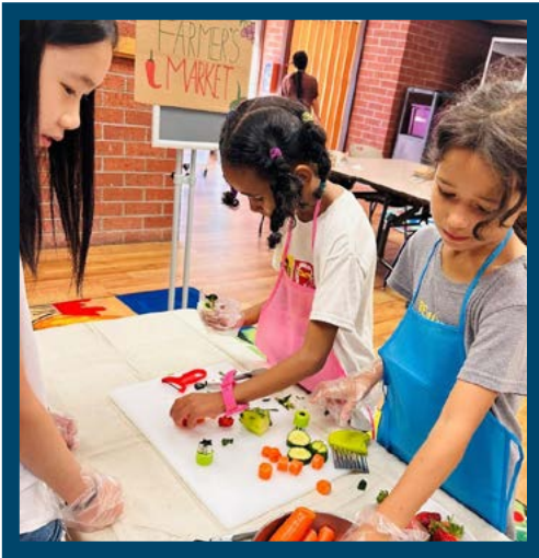
Teen intern leads a nutrition education activity for children at the Sacramento Public Library.

“I feel like my internship has helped me grow and improve in many different areas of my life. I feel like the skills I learned and developed over the summer such as communication, time management, teamwork/cooperation, leadership, confidence, and critical thinking, will help me at my jobs in the future and in my extracurricular activities.”