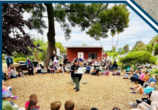
Solano County Library children's librarian reads to kids at Loma Vista Farm in Vallejo