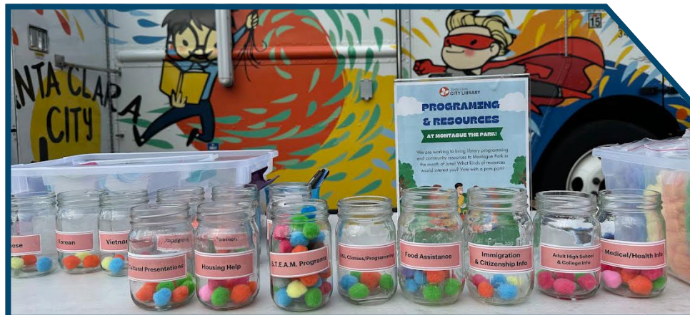
Community members served by Santa Clara City Library weigh in on library services and programming important to them and their families.

and services helped them connect with people who weren't previously engaged with the library.