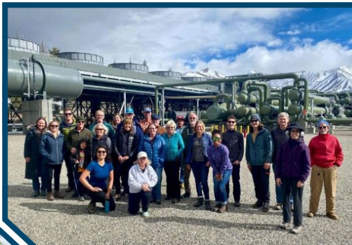
Mono County Free Library Geothermal Plant Tour