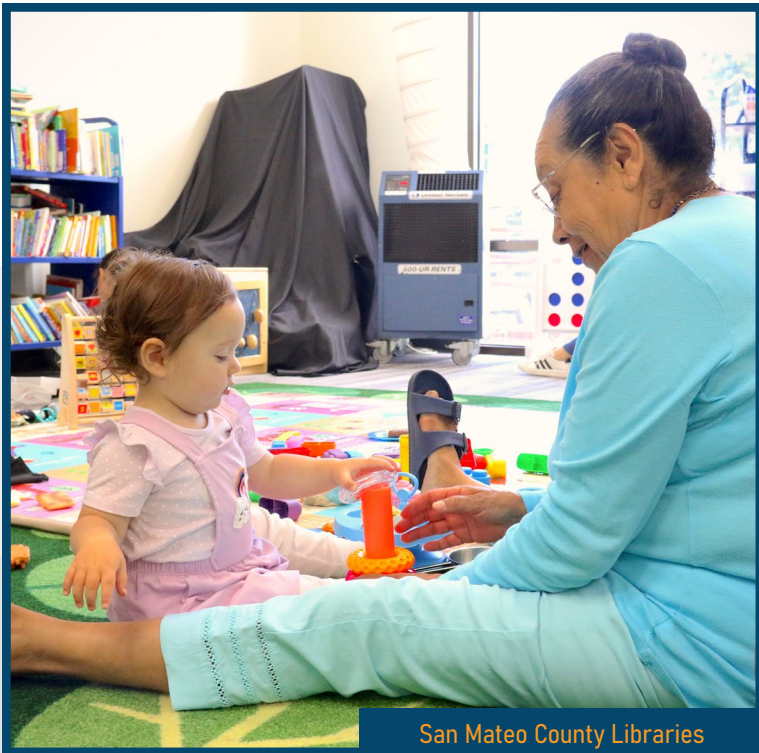
San Mateo County Libraries