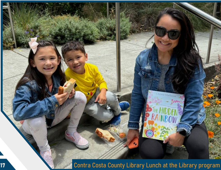
Contra Costa County Library Lunch at the Library program