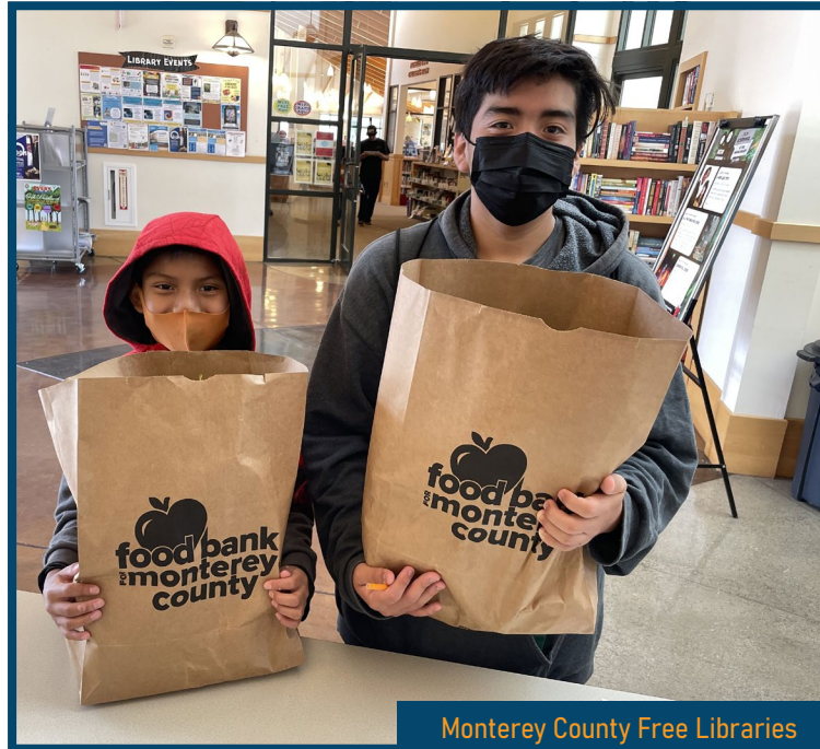
Monterey County Free Libraries