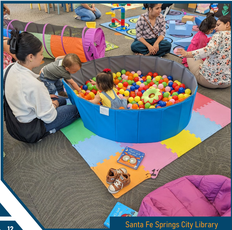
Santa Fe Springs City Library

Family, Friend, and Neighbor caregivers recognized and understood the important role they play in a young child's development, with 95 percent of survey respondents reporting they helped the children they care for get ready to read, and 94 percent reporting they now see themselves as a kind of teacher to the children they care for.