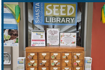
Shasta Public Libraries' Seed Library