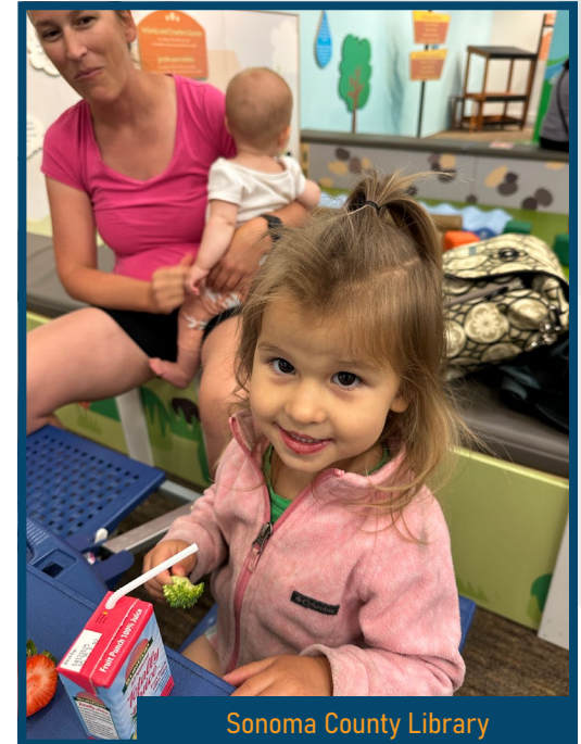
Sonoma County Library

"The program is great – a good idea for the community. We would like to participate in the next events. Everybody was very nice and friendly, and my child really enjoyed it. Summer can be long and it is also expensive, as well as tiring, cooking three meals a day. Thanks, it's a very helpful and meaningful program. MUCHAS GRACIAS."