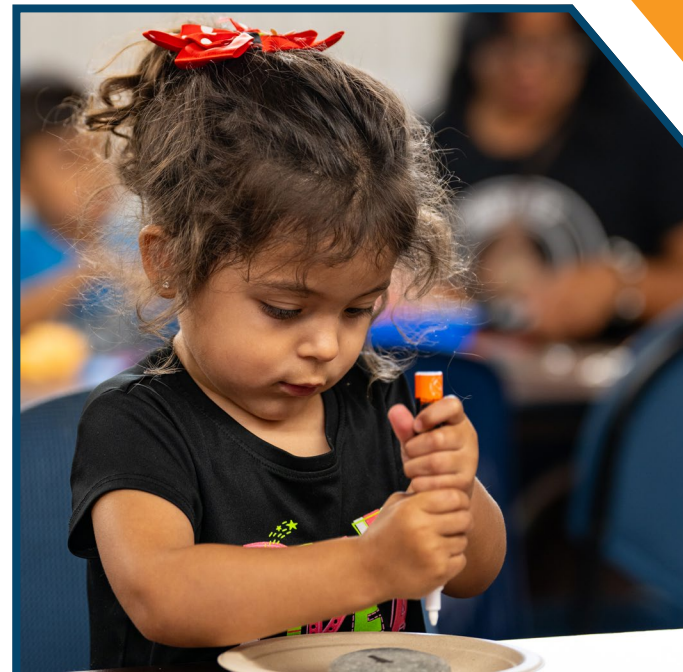
Creating Connection Program for Youth and Families at the Azusa City Library