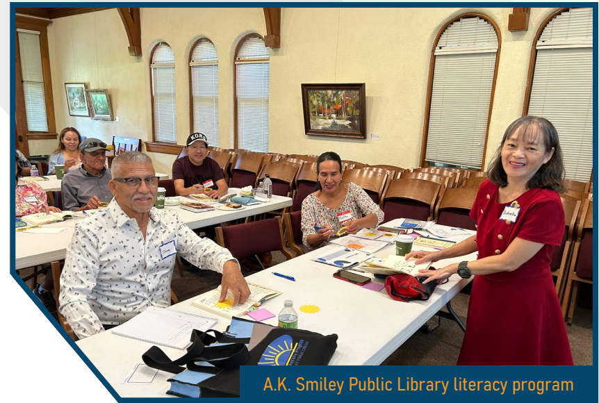
A.K. Smiley Public Library literacy program