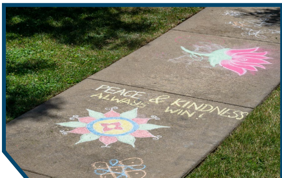
Telegu Heritage Project, Folsom Public Library