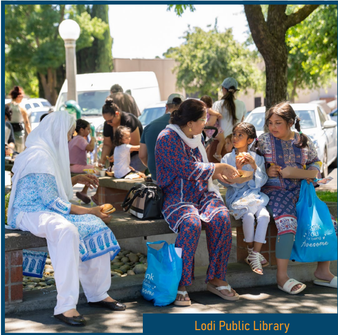
Lodi Public Library

The Lunch at the Library program is supported with funds from the State of California.