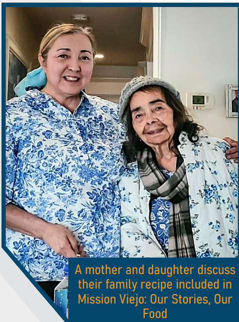
A mother and daughter discuss their family recipe included in Mission Viejo: Our Stories, Our Food

Inspiration Grants give libraries the opportunity to react to “a-ha moments” and carry out innovative projects when inspiration strikes.