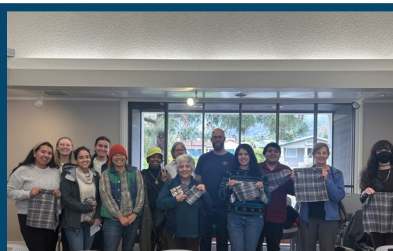
Santa Barbara Public Library Mending Workshop