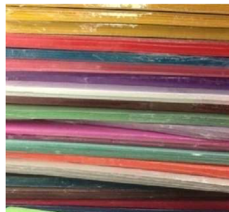
32. Large Construction Paper, 12"x 18" Available at Central Library Only