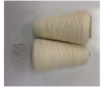
29. Natural Cotton Wrap Yarn