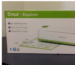
48. Cricut Explore (Paper cutting machine) Available at Central Library only