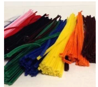
25. Pipe cleaners