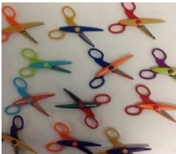
6. Krazy Kut Scissors