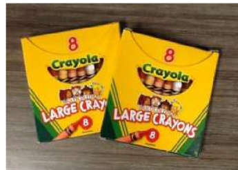
4. Multicultural Large Crayons