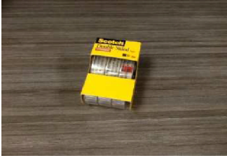
13. Double-Sided Tape