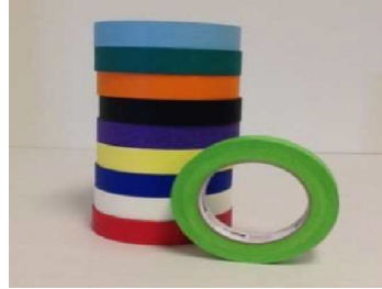
40. 1/2" Colored Masking Tape