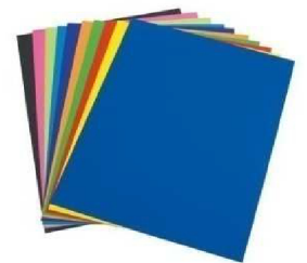
38. Colored Poster Board