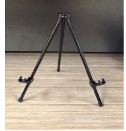
42. Tabletop Easel