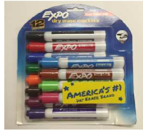
41. Dry Erase Markers