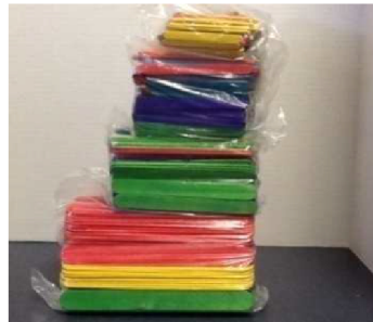
24. Colored craft sticks