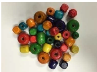
22. Wooden beads