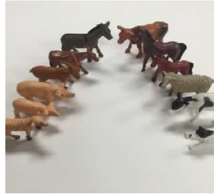
16. Farm animal figurines - Limit 1 per student