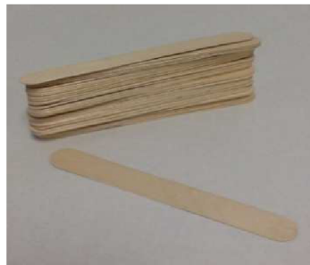
23. Natural craft sticks