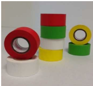
9. Removable Poster Tape