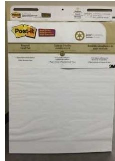
45. Easel Pad