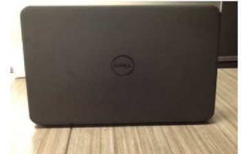
46. 15.6" Laptop