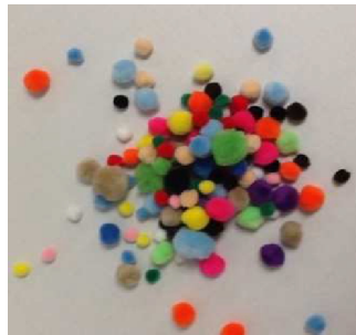
19. Pom Poms