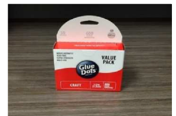
12. Glue Dots