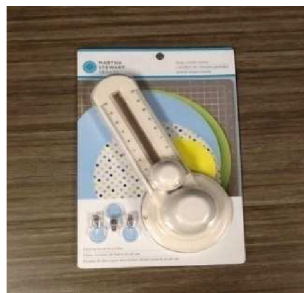
7. Large Circle Cutter