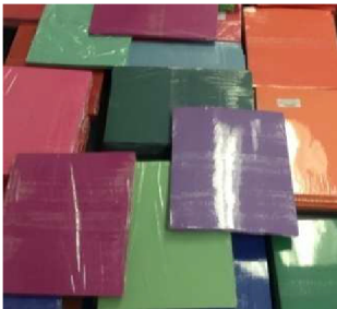
31. Construction Paper 9"x12"