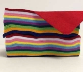
14. Felt Sheets