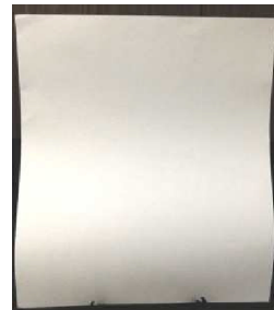
37. White Poster Board