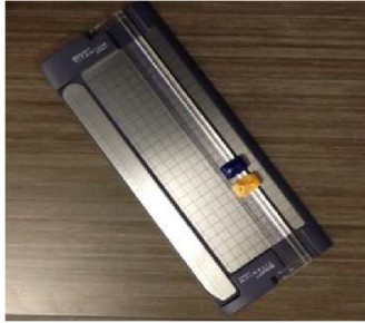
43. Paper Trimmer