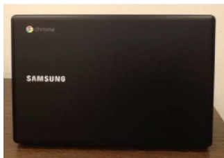
47. Chromebook (WiFi, 11.6")