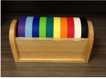
39. 1" Colored Masking Tape & Dispenser

The following items must stay inside the library ( May only request 1 total)