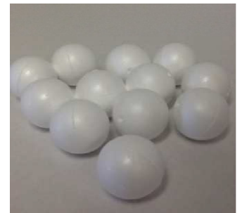
21. Styrofoam balls