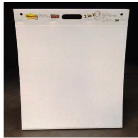
44. Dry Erase Table Top Pad