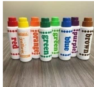
5. Dot Art Markers Available at Central Library Only