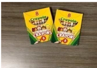
3. Multicultural Standard Crayons