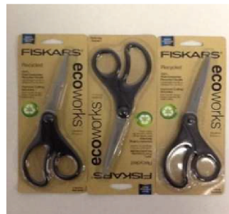
8. 8" Teacher Scissors