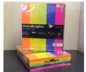
34. Bright Color Paper, 8 1/2" x 11"