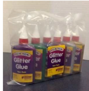
11. Glitter Glue