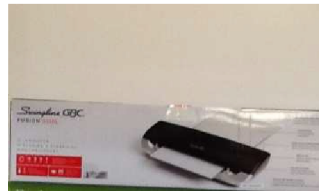
49. Laminator - Fusion 3100L 12" Available at Central Library Only