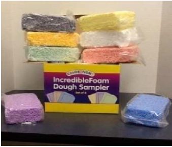
26. Foam dough