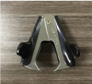
35. Staple Remover