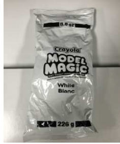
27. Modeling Clay - Crayola® Model Magic 8 oz (White) Limit 1 per student