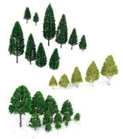
17. Mini trees