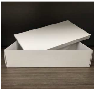
30. Shoe box (white) - Limit 1 per student