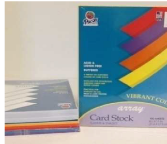
33. Card Stock