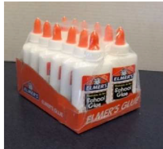
10. Washable School Glue